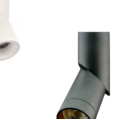
LED light to be installed on 1-phase 2 wire track or on surface.